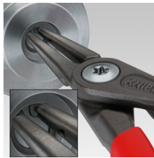
Slim head shape