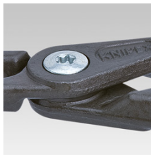
Bolted joint: high precision and smooth action