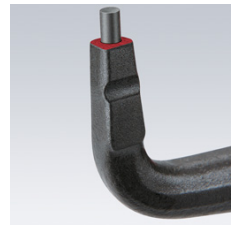
Sturdy, inserted tips: made from high-density spring steel