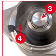
febi no. 26775 ref. no. 611 200 04 70